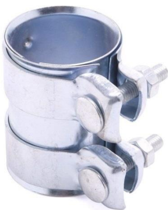
Universal Exhaust Pipe Sleeve Clamp

The overall length of the exhaust centre pipe must not be altered. You may either use a Universal Exhaust Pipe Sleeve Clamp as shown below or make a slip joint.