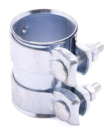
Universal Exhaust Pipe Sleeve Clamp

The overall length/bore of the exhaust centre pipe must not be altered. It is permitted to use a Universal Exhaust Pipe Sleeve Clamp as shown below or make a slip joint.